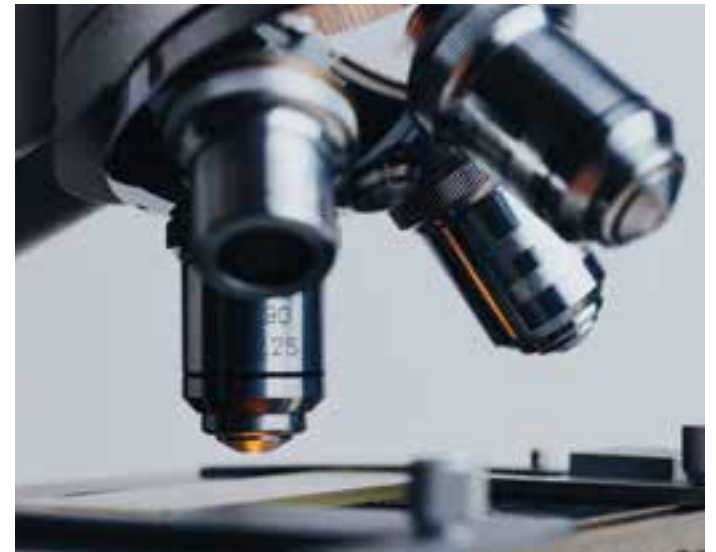
Quality and Control